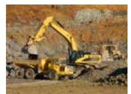
· Mobile Equipment