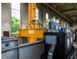
· Hydraulic Reservoir