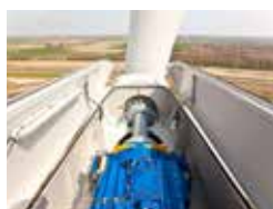
· Industrial Gearbox