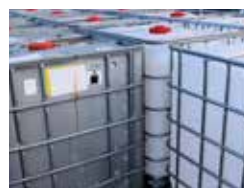
· IBC & Fluid Tank